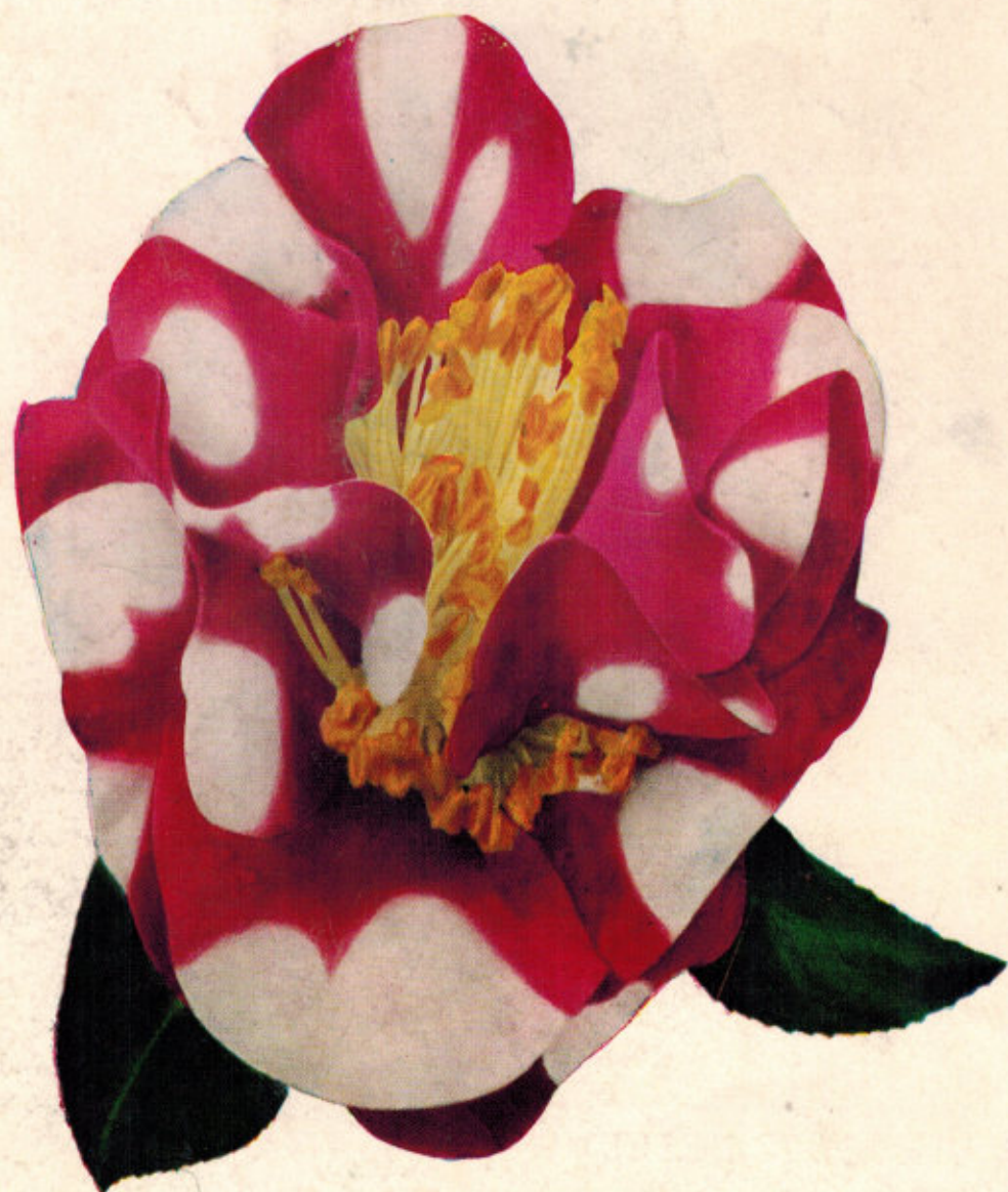
LA REINE VARIEGATED